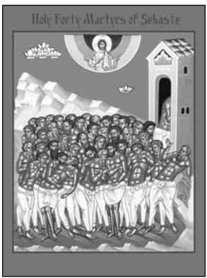
Holy Forty Martyrs of Sebaste