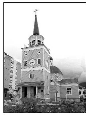
St. Michael Cathedral Sitka, AK