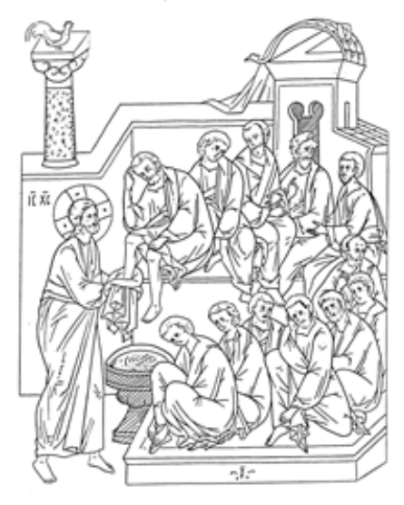
OUR LOKE WASHES THE FEET OF THE DISCIPLES

Jesus said to them, "Leave her alone. Why do you trouble her? She has performed a good service for me. You always have poor people among you, and you can show